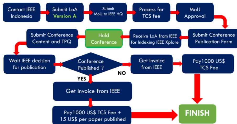
Scheme A: No Financial Support from IEEE Organization Unit in Indonesia

In scheme A, committee of a conference has to contact IEEE Indonesia and then submit Letter of Agreement (LoA) Version A and Memorandum of Understanding (MoU) to IEEE HQ. After that, TCS fee will be processed. The next step is MoU Approval. After MoU is approved, conference committee has to submit conference publication form to receive LoA from IEEE for Indexing IEEE Xplore. When LoA is received, committee can hold a conference. After the conference, committee has to submit conference content and Technical Program Questionnaire (TPQ), and wait for IEEE decision for publication. If the conference is published, committee will get invoice from IEEE and then pay 1000 US$ TCS Fee + 15 US$ per paper published. If the conference is not published, committee will get invoice from IEEE and then pay 1000 US$ TCS Fee.